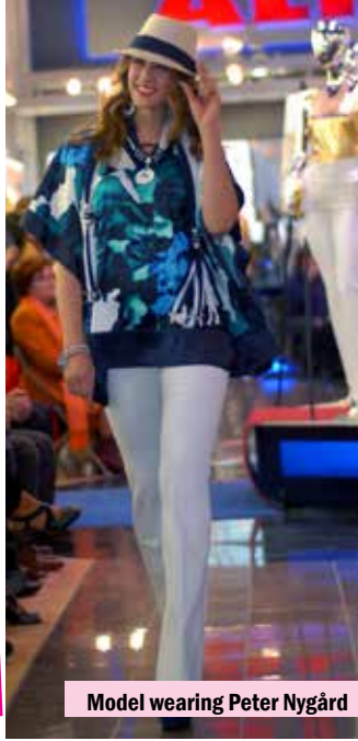
Model wearing Peter Nygård