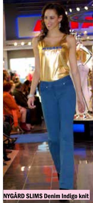
NYGÅRD SLIMS Denim Indigo knit