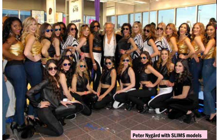
Peter Nygård with SLIMS models

the professional models, NYGÅRD Company Associates also walked the catwalk to cheers from the crowd. Overwhelming demand broke sales records as shoppers of all ages rushed to the racks to purchase what is going to be this seasons hottest item NYGÅRD SLIMS - 2 pairs sold every minute! SLIMS are the personal design of Peter Nygård - he has overseen all aspects of the design, including the patented patterns. SLIMS will make you one size smaller, lift and shape the butt and are guaranteed to enhance your curves from the sculpt technology waistband to the hem adding 2-5 inches in length