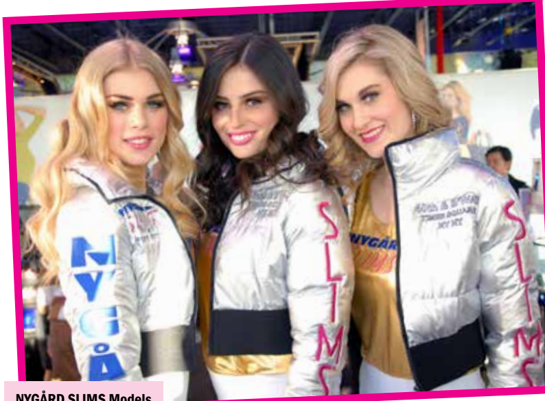
NYGÅRD SLIMS Models